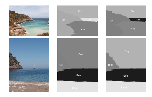
Fig. 2. Exemplar results for the beach domain, depicting the original image, and the GA application without and with context utilization.

where I_{min} is the sum of the minimum degrees of confidence assigned of each region hypotheses set and I_{max} the sum of the maximum degrees of confidence values respectively.